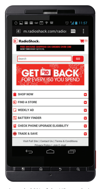
There is a RadioShack location within 5 miles for approximately 90% of the US population, so we are leveraging mobile as a very powerful way to reach our local customers.