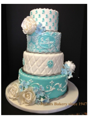
A wedding cake designed by Miller's Bakery.