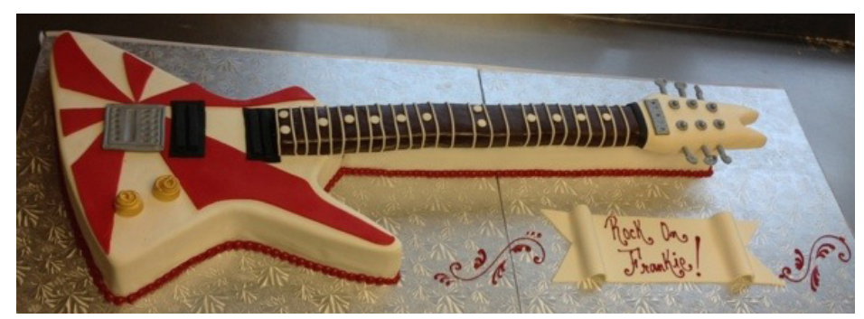
The bakery offers fun cake designs for any occasion.

he uses location bid adjustments in combination with location extensions to increase bids by 50 percent for customers searching from within a 2-mile radius of either bakery location. He also increases bids by 25 percent for customers searching from anywhere in Cliffside Park or Tenafly, the towns where the bakeries are located.