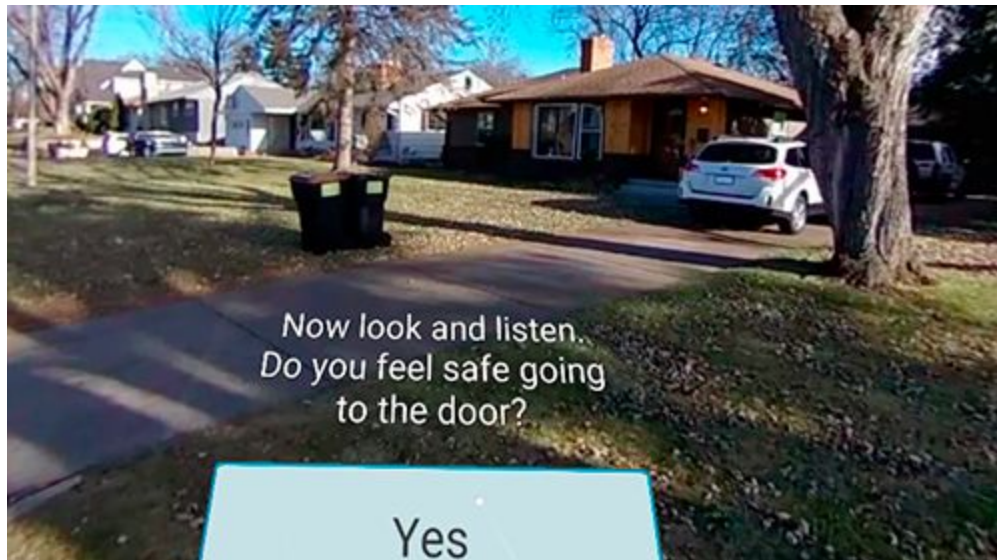
Preparing for a home visit

Walden's Innovation Incubator didn't just want a video game-like experience — they wanted to simulate life-like situations that students might encounter in the field.