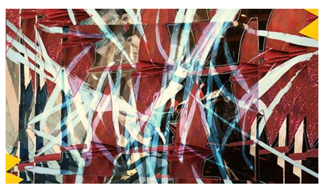
Lauren Gatta's Tilt Brush painting, printed with collage

The goal of using these tools, says Vossoughi, "is not finding an endpoint, but opening things up—giving students an expanded sense of what's possible in drawing and visual thinking. It's exciting for them to use Tilt Brush and VR to create their own process—something that never existed before. The exploration that can happen is limitless."