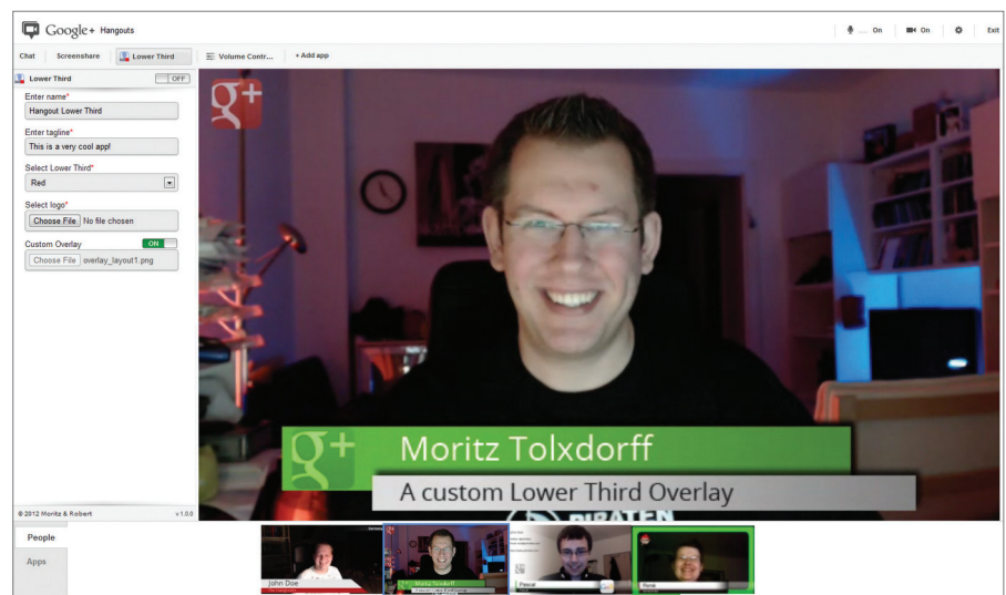
Google+ Hangouts can look as official as the nightly news with the Lower Third app, which adds customizable titles for on-screen participants.

There are many opportunities for branded experiences in Google+ Hangout Apps. Here are a few of them: