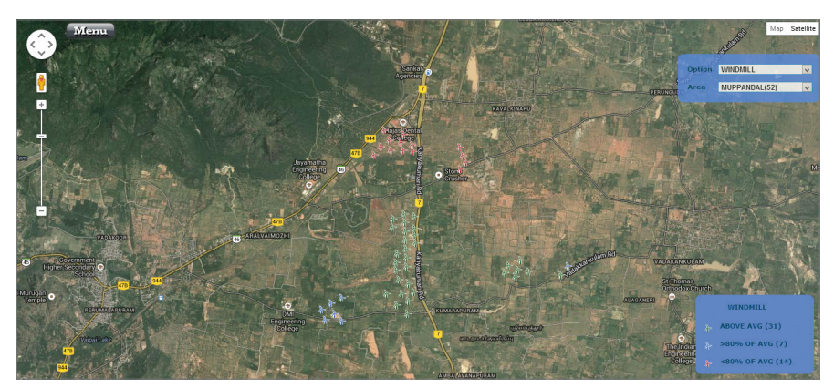
Figure 1. An overview of MCL wind farms' locations plotted on Google Maps API for Business