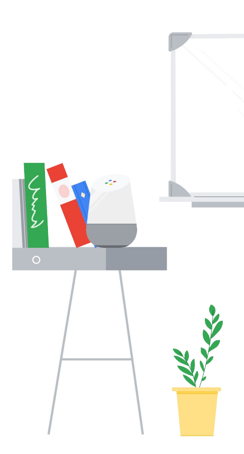
Google for Education